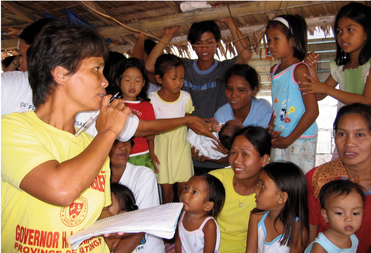
A health worker in the Philippines calls names of girls for weighing.

as condoms, is important not only for preventing unwanted pregnancies, but also in preventing the spread of sexually transmitted diseases such as AIDS. In 1994 women represented about 40 percent of all AIDS cases worldwide. However, women are contracting the virus at a faster rate than men, and in 2006, women represented over 50 percent of adults living with HIV globally and nearly 60 percent of those in Sub-Saharan Africa. 19