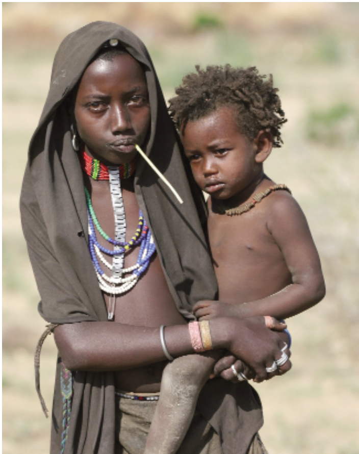
African Woman and Child.

On the other hand, breaking down the barriers that deny women access to health and family planning services, education, employment, land, and credit both increases women’s autonomy and encourages lower fertility rates. 2 Across continents, when women have more control over their lives, when they are less dependent on children and their role as a mother for support and security, they choose to have smaller families and to start them later. Throughout this