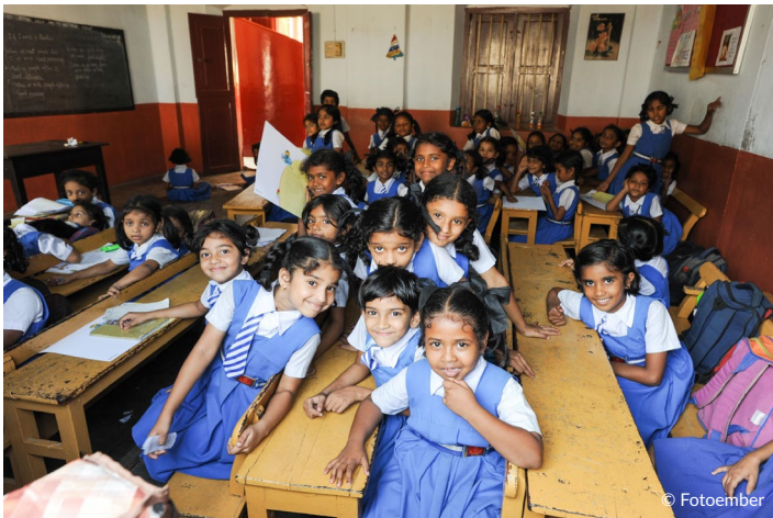
Children at school in Mysore, India.

There is evidence that education enhances women's economic and social self-reliance, so that educated women are less likely to want large numbers of children, or sons, to provide them economic support in old age or to legitimize their positions in their husband's families. However, simple literacy alone is not enough to influence family size. Studies are finding that there is a minimum threshold of education (more than 5 or 6 years) that must be achieved before there are significant improvements in female autonomy (or decision-making power) that will impact family size, particularly in highly gender-stratified societies like India.